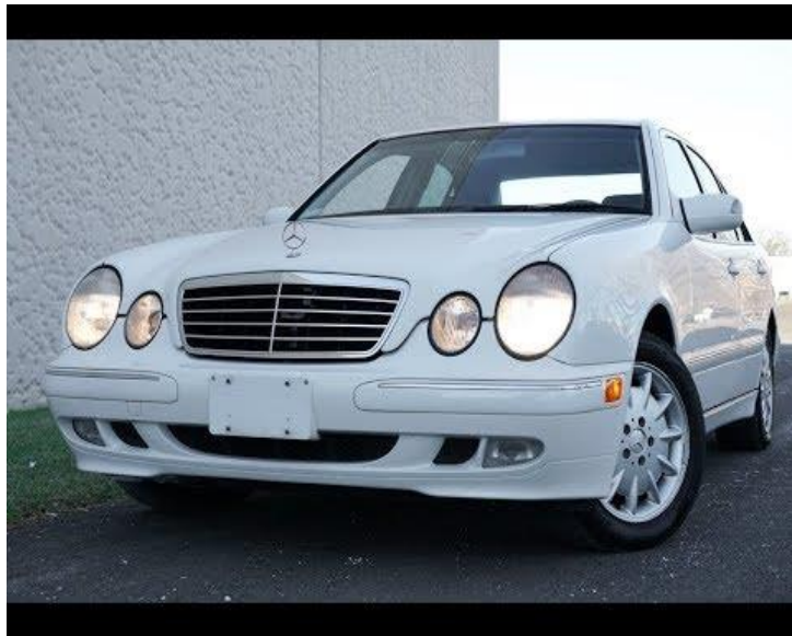
Vehicle depicted above similar to suspect vehicle.